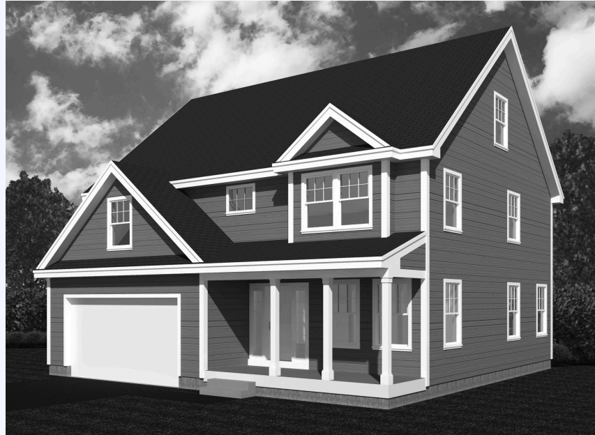
Rendering of the Chestnut House