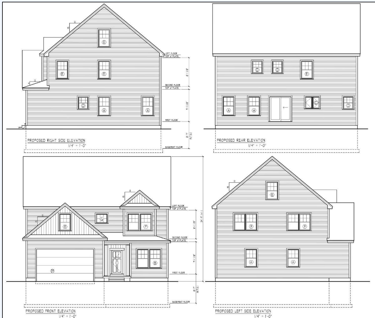
Chestnut House Exterior Elevations