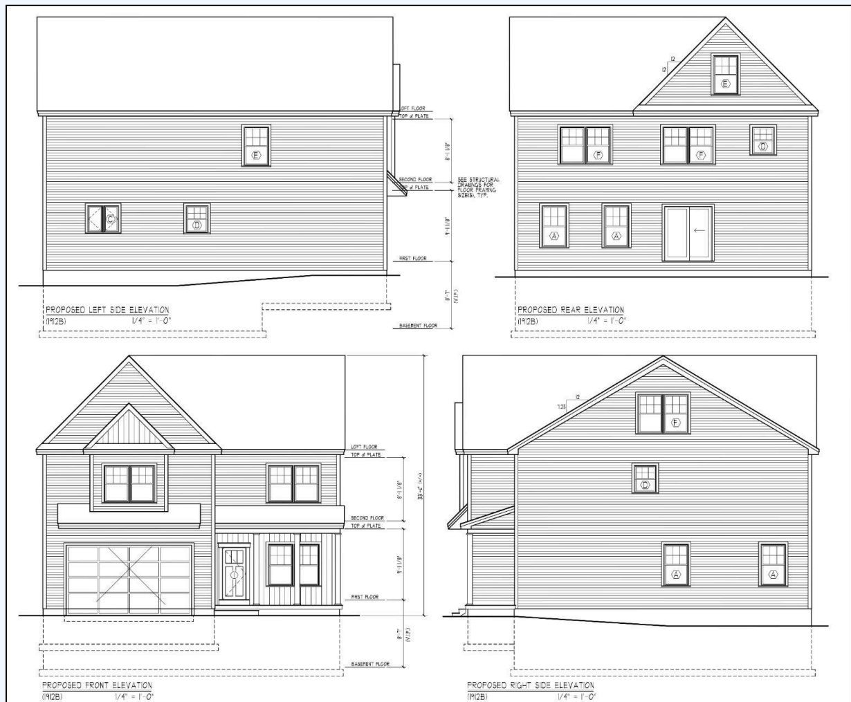
Birch House Exterior Elevations