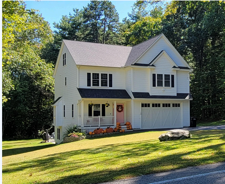
Past project of the Birch house design.