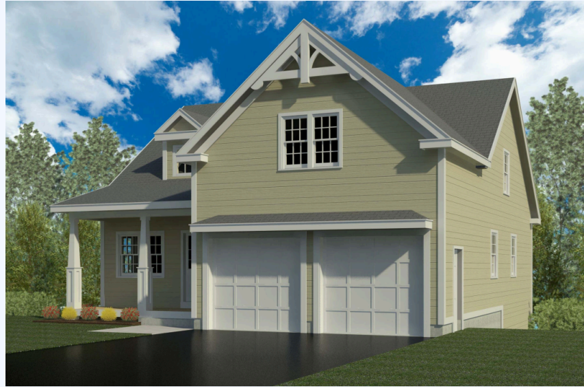
Rendering of the Alder House