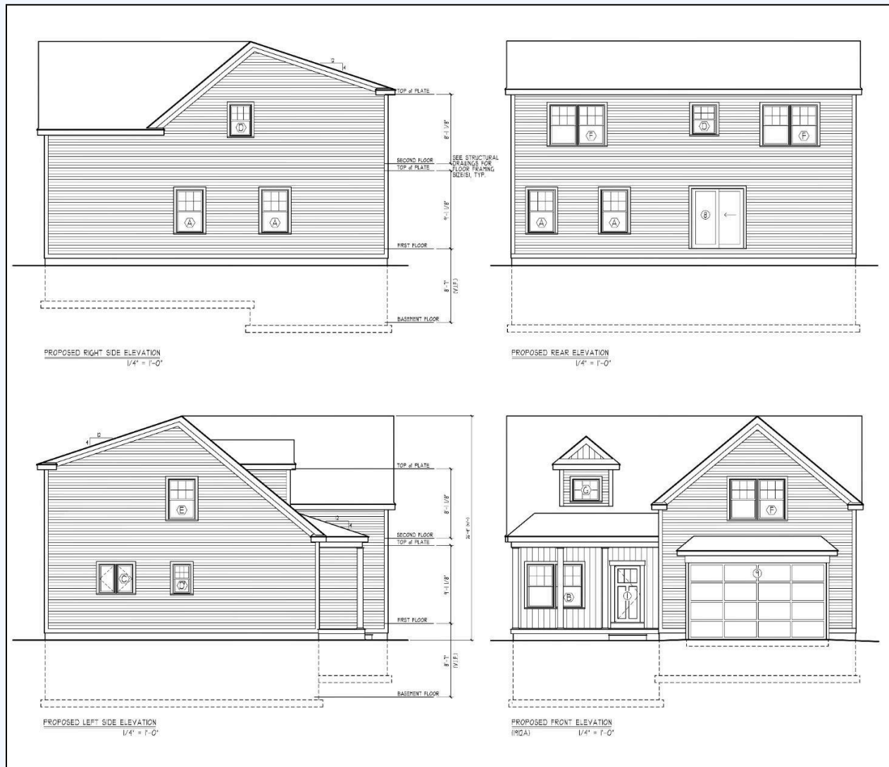
Alder House Exterior Elevations

Visit us online at https://applewoodconstruction.com/new-builds/newbury-cricket-lane